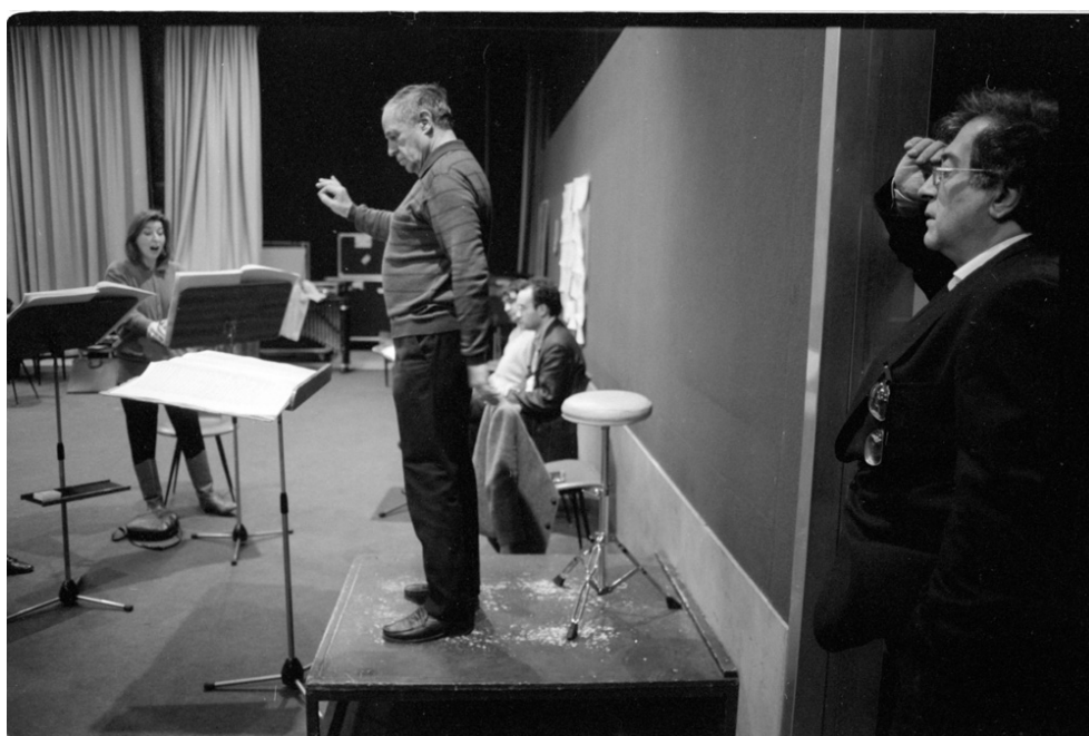
Pierre Boulez rehearses a work by Luciano Berio with the Ensemble Intercontemporain, Paris 1989