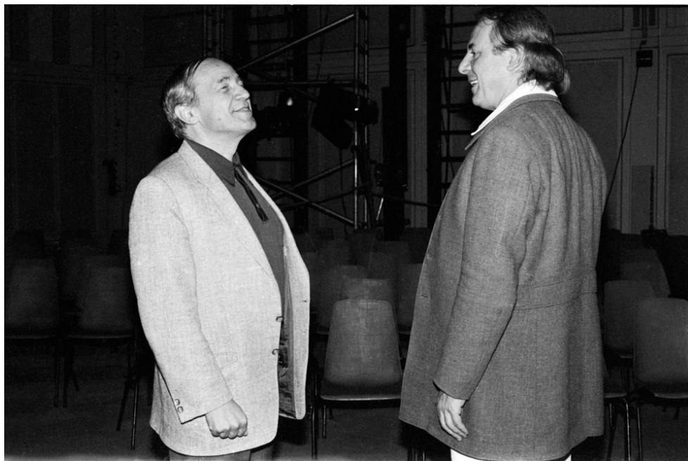
Pierre Boulez and Karlheinz Stockhausen at IRCAM, 1983