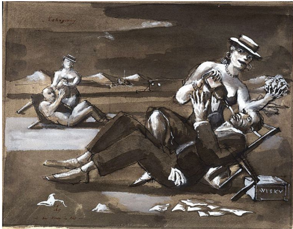
Projection displays by Caspar Neher for the premiere of "Rise and Fall of the City of Mahagonny"