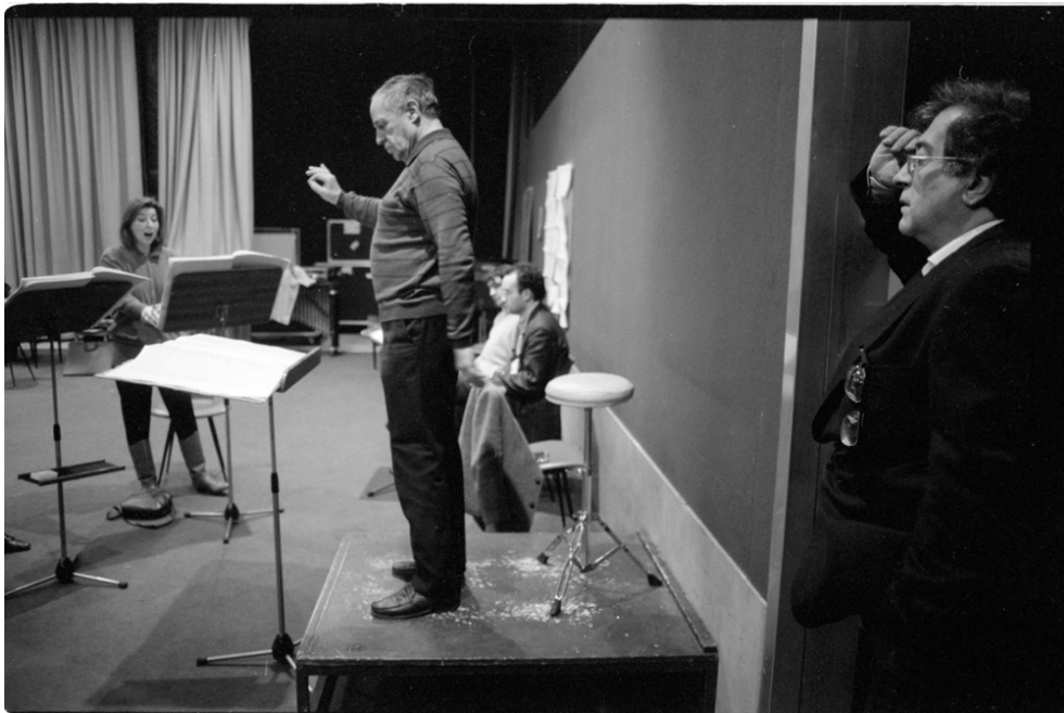
Pierre Boulez rehearses a work by Luciano Berio with the Ensemble Intercontemporain, Paris 1989