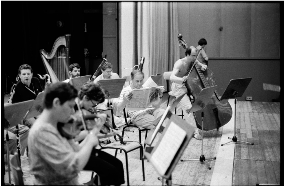
Pierre Boulez and musicians of Ensemble Intercontemporain during rehearsals at the festival Grange de Meslay in 1985

It's the photographs that show Boulez in cooperation with his great colleagues that are of music historical relevance: Luciano Berio, Friedrich Cerha, Karlheinz Stockhausen.