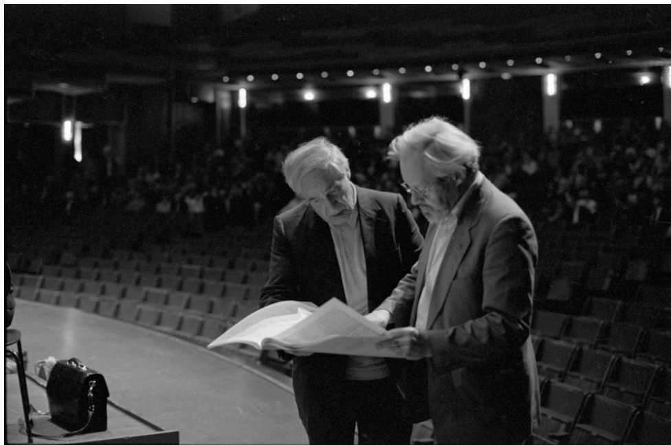
Pierre Boulez and Friedrich Cerha study Impulse by Cerha at a rehearsal in Salzburg in 1996